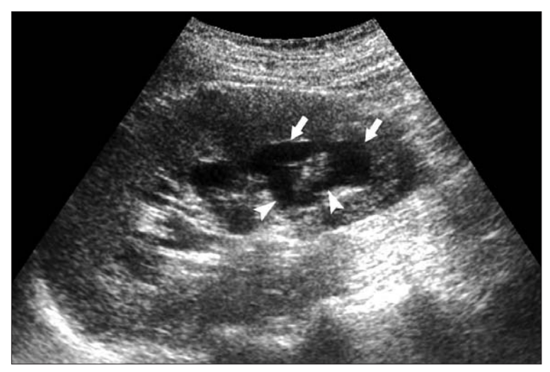
Figure 5. US image shows triangular fluid-filled cavities ( arrows ) with narrow infundibuli ( arrowheads ) placed on renal papilla that communicate with the collecting system ( arrowheads ), in a 26-year-old male patient with sickle cell S/S. Renal pelvis was not dilated.

Vascular occlusion, viral hepatitis, iron overload, and drug reactions may contribute to SCD-related liver disease (8). In one study, the sonographic appearance of the liver in SCD and thalassemia intermedia has been described in 105 patients. Hepatomegaly was demonstrated in 70.5%, and bright liver in 3.8% of these patients (3). An autopsy series reported a 91% prevalence of hepatomegaly in patients with SCD (9). Hepatomegaly was the most common pathologic finding in the current study, its frequency being 72.6% in S/S group and 66.7% in S/ß<sup>thal</sup> group. However, hepatomegaly is a common clinical finding with various causes. Infectious, infiltrative, and granulomatous disease, malignancy, and other