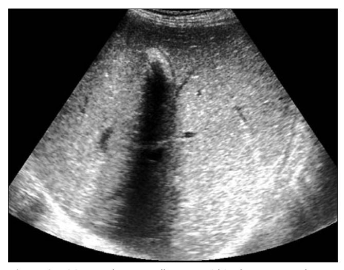
Figure 1. US image shows small stones within the contracted gallbladder with distal acoustic shadowing and bright liver in a 13-year-old male patient with sickle cell S/S.