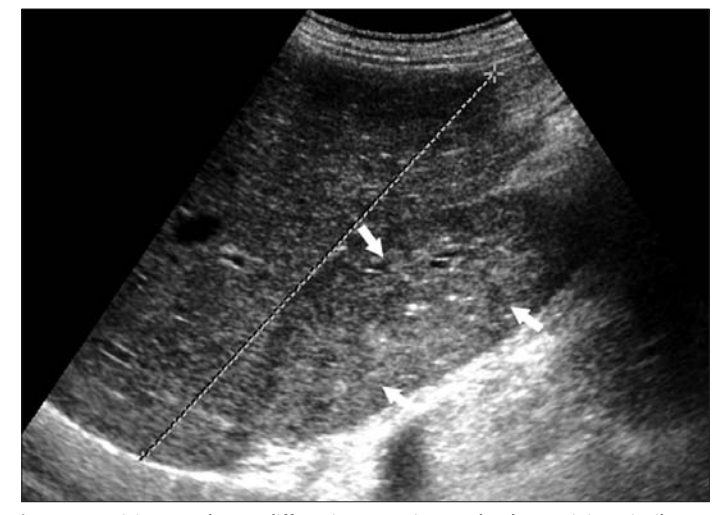
Figure 4. US image shows diffuse increase in renal echogenicity, similar to that of the adjacent liver ( arrows ), in a 33-year-old female patient with sickle cell S/S. Corticomedullary differentiation is poor ( arrows ).