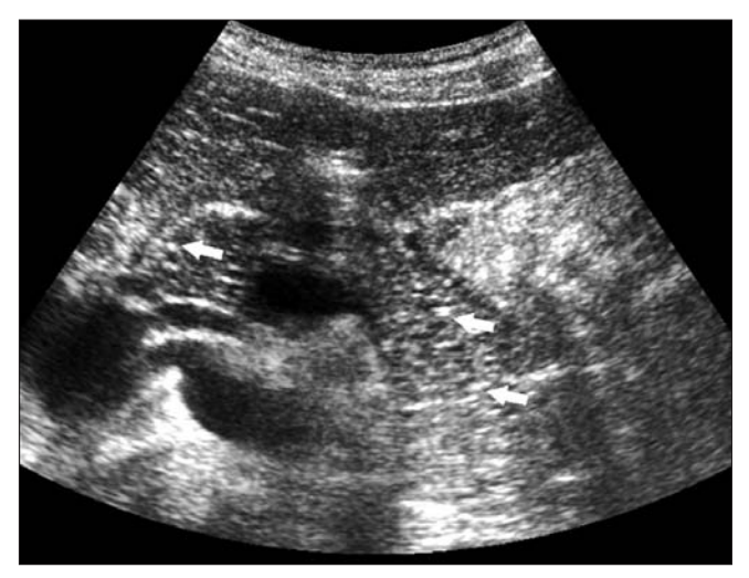
Figure 2. US image shows multiple millimetric echogenic foci (arrows) in pancreas in a 19-year-old male patient with sickle cell S/S.

of the spleen at the level of the hilum; and long axis of each kidney. The organ sizes were compared to published data obtained from a healthy Turkish population of normal distribution for age and height for infants and children (5). For adult patients, hepatomegaly and splenomegaly were defined as the long axis of the organs longer than 155 mm and 130 mm, respectively (6). The upper limits for normal right and left kidneys were accepted as 128 mm and 130 mm, respectively (7). Hepatomegaly and splenomegaly were defined as "mild" if the two measurements exceeded the upper limit of normal by less than 10%; "moderate" when the measurement was 10% to 20% greater, and "marked" when it exceeded the upper limit of normal by more than 20%.